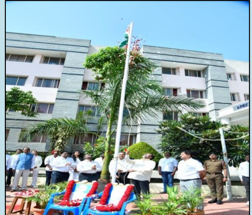
National flag hoisting