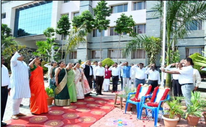
All Principals of M S Ramaiah Institution